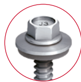
Self-drilling screw JT3-2H-plus-5.5